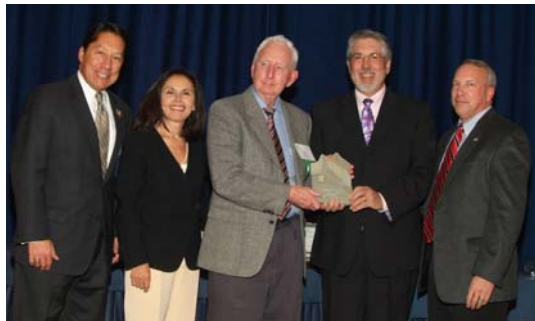
Middle Market Entrepreneurs Group and Colorado PTAC -- Business Climate Awards

The Company to Watch Award was presented to TechWise, a privately woman-owned company, dedicated to bringing world-class technical and professional services to government and commercial clients. Headquartered in Colorado Springs, TechWise operates in six additional states. Established in 1994, it has grown into a corporation with highly qualified and experienced military analysts, technical experts, service providers, and management staff.