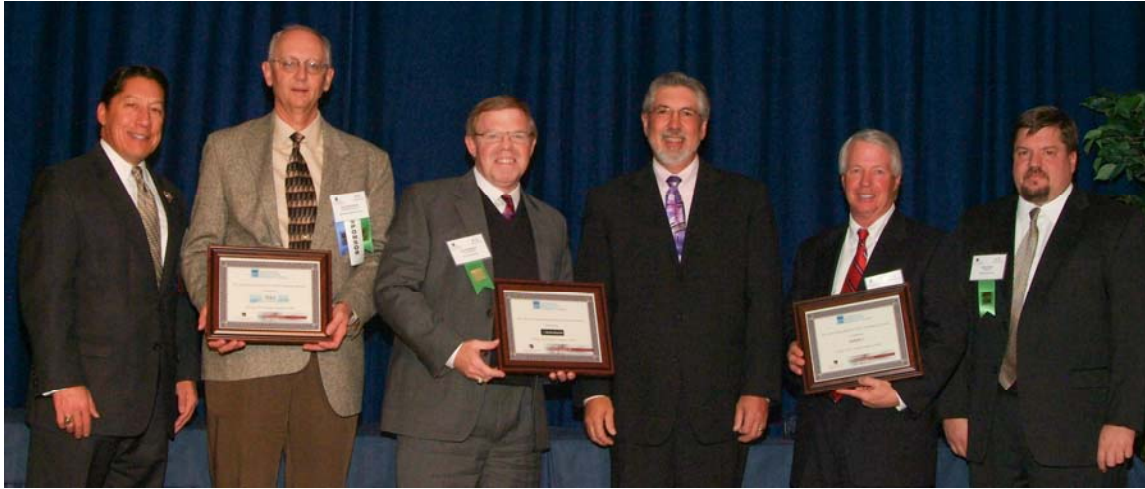
Neumann Systems Group, Rivada Networks, and Cetis ~ 2010 Colorado Companies to Watch

In 2011 the State of Colorado Office of Economic Development and International Trade presented their “ Colorado Companies to Watch ” award to 3 Colorado Springs Companies: Cetis, Neumann Systems Group, and Rivada Networks.