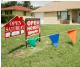
Where Home Prices Are Likely To Rise