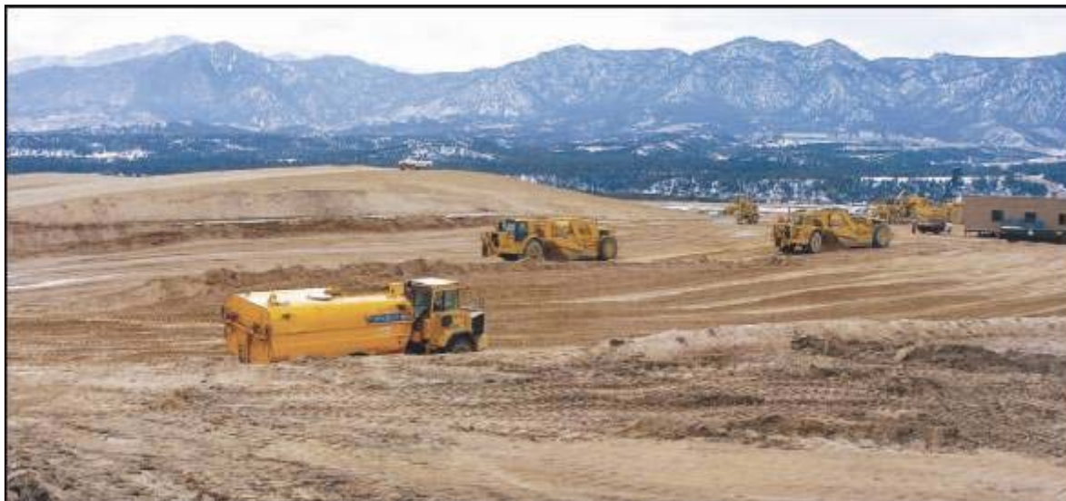
Construction was under way Wednesday on the new, expanded FedEx data center in the Northgate business park.